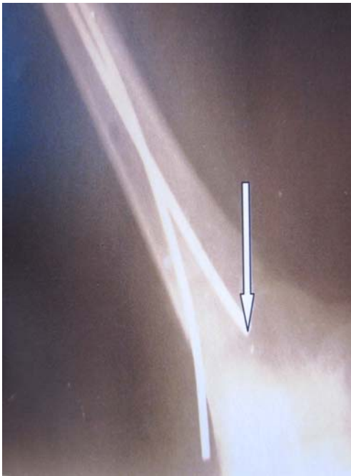
Fig. (10). post- operative radiograph showing intra- operative breakage of nail.