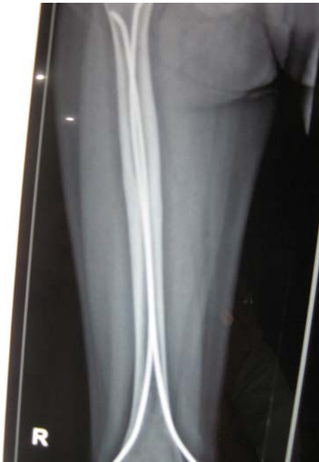
Fig. (2). immediate post- operative radiograph showing good alignment after fixation with TENS.

In our study we detected several short term complications. In our study we found the most common complication was pain at nail entry site (14 of 70, 60%) which was relieved when nail was removed. 4 cases (5.71%) had local inflammatory reaction due to nails, in the form of ulceration (Figs. 3, 4) or bursa formation (Figs. 5, 6). Superficial infection occurred in 2 cases (2.85%). At the end of 1 year, 2 cases (2.85%) of limb length discrepancies in which the injured limb was about 1.5cms greater than the normal limb. Proximal migration occurred in 2 cases (2.85%). Acute reactive synovitis due to nails at 7 months post operatively occurred in 2 cases (2.85%) (Figs. 7, 8). There were 2 cases (2.85%) of knee stiffness (Fig. 9). There were also 2 cases (2.85%) of per operative breakage of nail and no part was outside the cortex (Fig. 10). Varus angulation of fracture site occurred in 4 cases (5.71%) (Fig. 11). We experienced no case of delayed or non- union or deep infection in our series (Table 1).