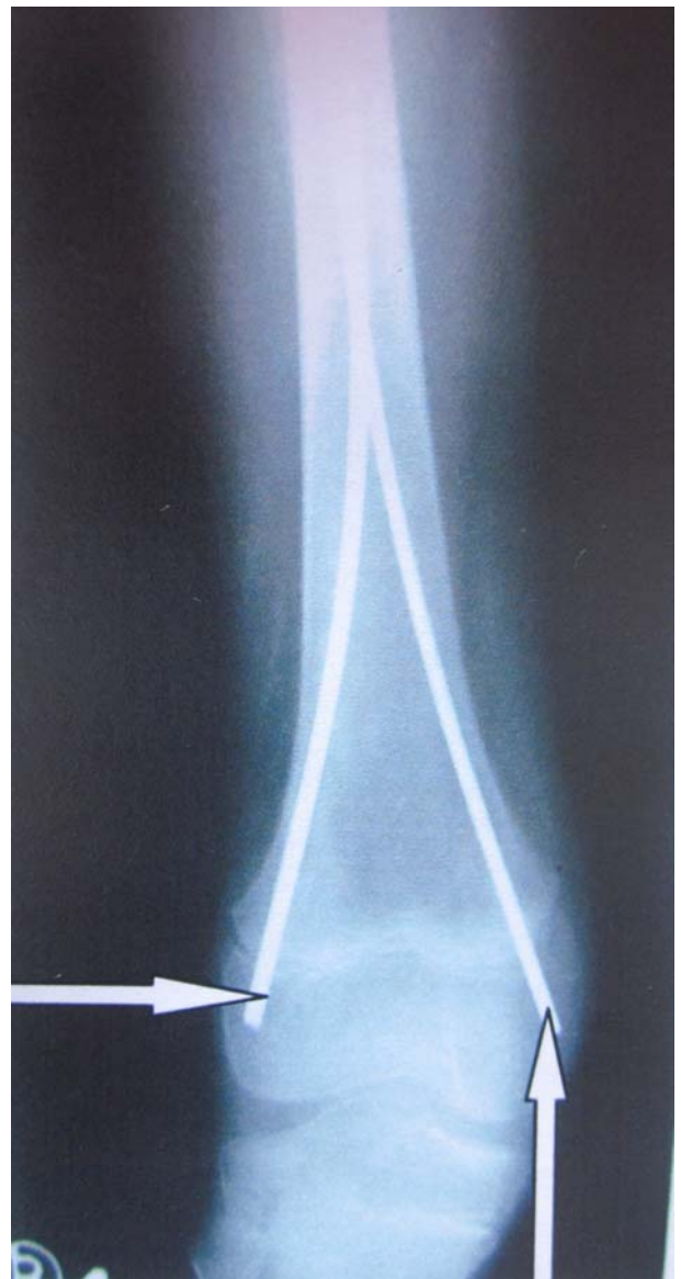
Fig. (8). Post- operative radiograph of Fig. (7).