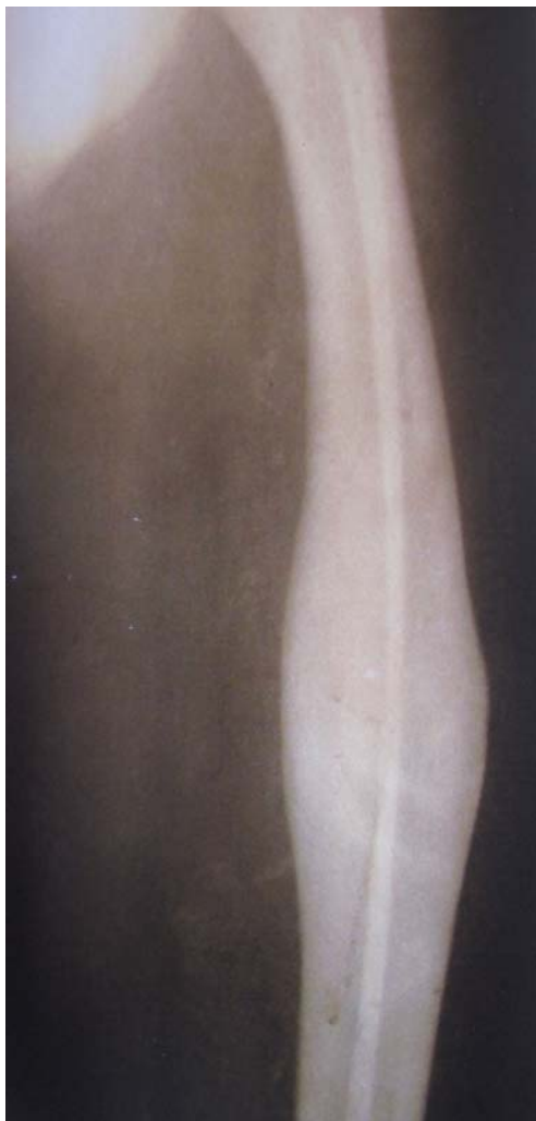
Fig. (11). post- operative radiograph at the end of 1 year showing varus angulation.