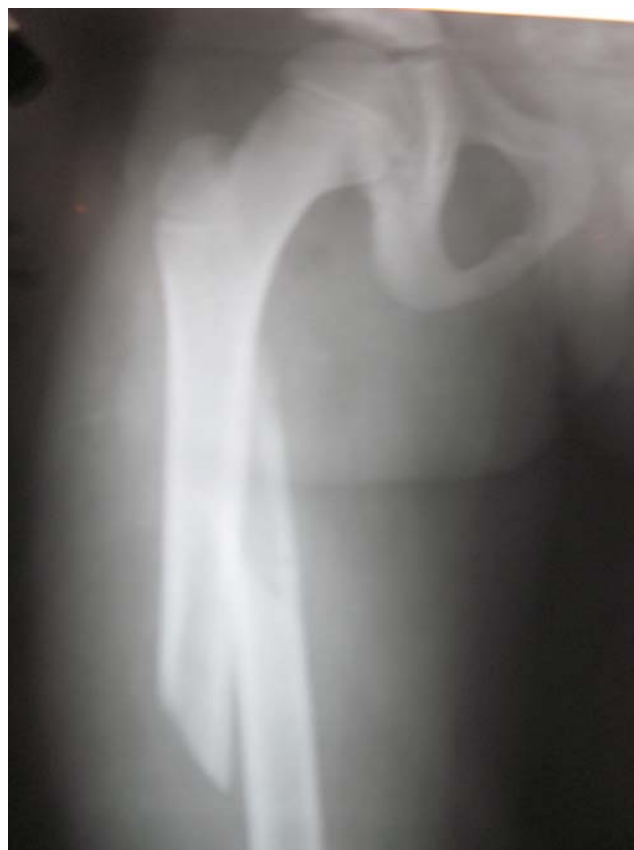
Fig. (1). Fracture mid-shaft right femur.

44 (62.86%) children had fracture in the mid-shaft (Fig. 1), 15 (21.42%) in the upper third while 11 (15.72%) in the lower third. 42 (60%) were transverse, 16 (22.8%) oblique, 7 (10%) spiral and 5 (7.2%) were comminuted fractures. 45 (64.28%) children had weight between 20kgs- 29kgs, 15 (21.42%) between 15kgs- 19kgs, 7 (10%) between 40- 49kgs while only 3 (4.3%) were between 30- 39kgs. Mean interval between injury and TENS nail fixation was 4 days (2 days to 6 days). Mean post-operative hospital stay was 4.13 days (min: 2 days to max: 11 days). Minimum nail size used was 2.5mm while maximum nail size used was 4mm. All the 70 cases were managed by closed reduction (Fig. 2). Callus appeared within 3 weeks, circumferential callus was seen within 5-6 weeks and full radiological union was achieved by 8 weeks to 10 weeks (mean 8.3 weeks). Time of nail removal varied from 6 months to 14 months with a mean of 8 months.