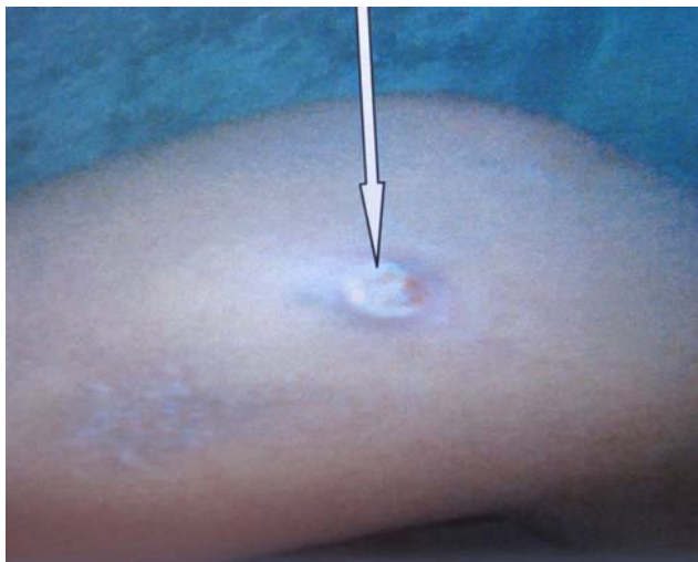
Fig. (3). inflammatory reaction due to TENS nail, medial entry.

In our study we detected several short term complications. In our study we found the most common complication was pain at nail entry site (14 of 70, 60%) which was relieved when nail was removed. 4 cases (5.71%) had local inflammatory reaction due to nails, in the form of ulceration (Figs. 3, 4) or bursa formation (Figs. 5, 6). Superficial infection occurred in 2 cases (2.85%). At the end of 1 year, 2 cases (2.85%) of limb length discrepancies in which the injured limb was about 1.5cms greater than the normal limb. Proximal migration occurred in 2 cases (2.85%). Acute reactive synovitis due to nails at 7 months post operatively occurred in 2 cases (2.85%) (Figs. 7, 8). There were 2 cases (2.85%) of knee stiffness (Fig. 9). There were also 2 cases (2.85%) of per operative breakage of nail and no part was outside the cortex (Fig. 10). Varus angulation of fracture site occurred in 4 cases (5.71%) (Fig. 11). We experienced no case of delayed or non- union or deep infection in our series (Table 1).