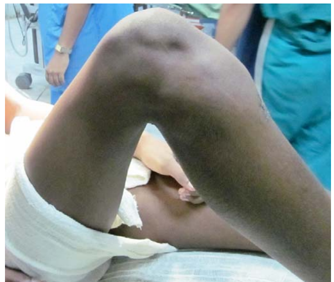
Fig. (9). Clinical photo showing knee stiffness.

Our study consisted of a cohort of 70 cases of shaft femur fractures in the age group 6- 14 years treated by titanium elastic nailing. All patients were operated as early as possible to achieve closed reduction and definitely to get the best result. In our cases the interval between the injury and operation ranged from 2 days to 6 days with a mean of