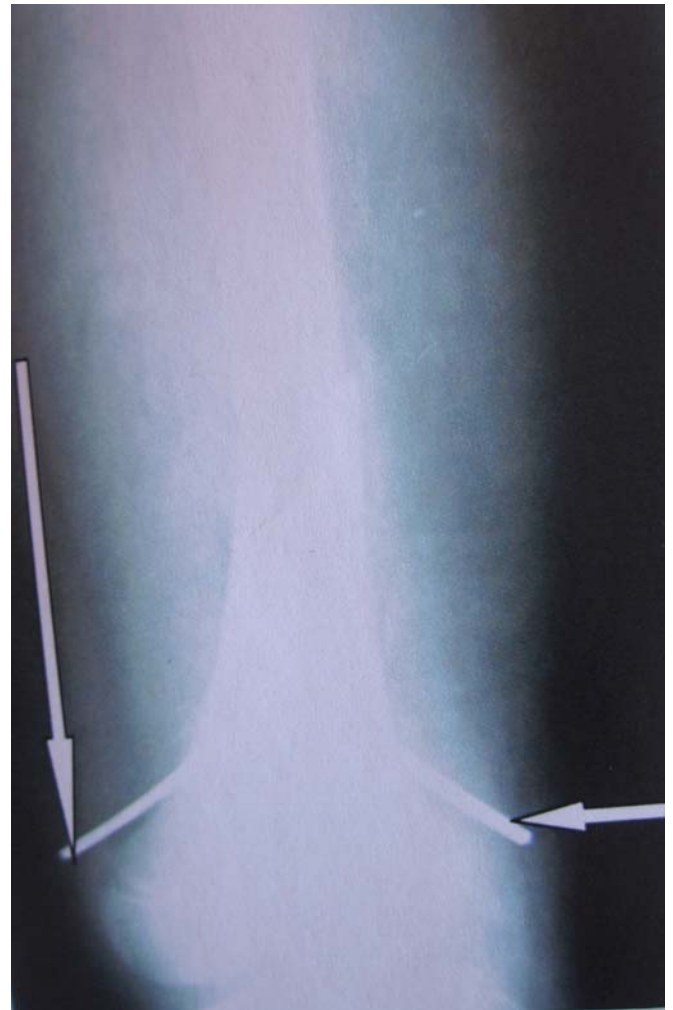
Fig. (4). post- operative radiograph of Fig. (3) showing excess nail length outside the cortices.