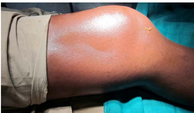
Fig. (7). Inflammatory reaction to nail (acute knee swelling).

Our study consisted of a cohort of 70 cases of shaft femur fractures in the age group 6- 14 years treated by titanium elastic nailing. All patients were operated as early as possible to achieve closed reduction and definitely to get the best result. In our cases the interval between the injury and operation ranged from 2 days to 6 days with a mean of