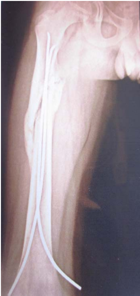
Fig. (6). post- operative radiograph of Fig. (5) showing prominent medial end.

nailing procedure, overall promising results published in different international journals and patient's demand probably has instilled confidence in our minds to begin this apparently new mode of fixation. However, starting titanium nailing in our set up was not a smooth sailing initially but we gradually did overcome the initial hindrance [8].