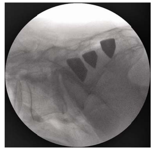
Fig. (4). Lateral fluoroscopic image of all 3 implants in place.