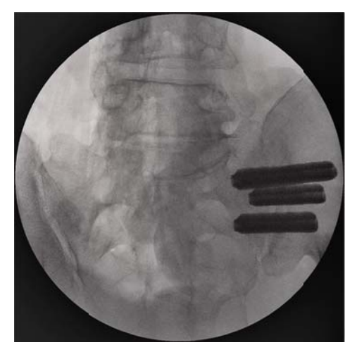
Fig. (3). AP fluoroscopic image of all 3 implants in place.