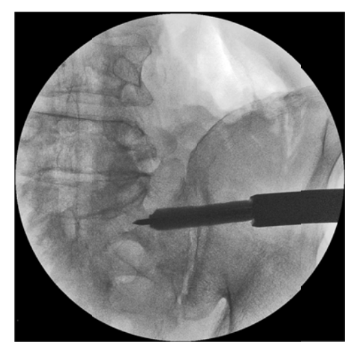
Fig. (2). Fluoroscopic image of the first implant placed over the Steinmann Pin.

In the reported cohort, 4 implants were placed unilaterally in one patient and bilaterally in another. Two short female patients received 2 implants each. All other patients received 3 implants. Four patients returned to have the contralateral side treated due to progressing symptoms and 1 patient underwent bilateral SI joint surgery on the same day.