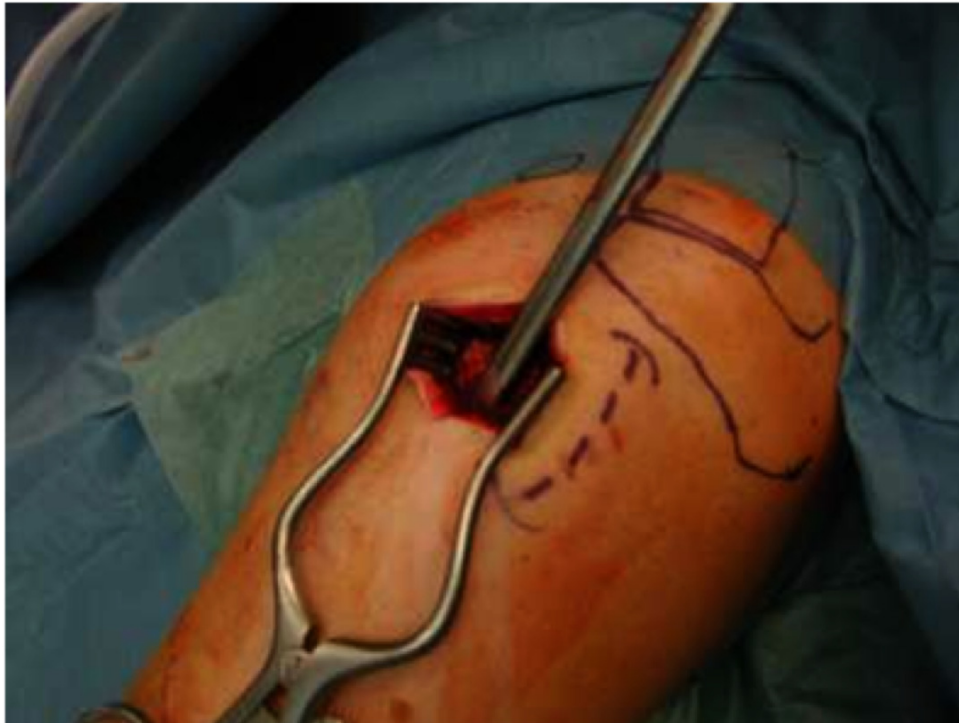
Fig. (1). Minimal anterolateral approach to a left proximal humerus. The anatomical landmarks (clavicle, acromion) have been marked. The dotted line marks the lateral aspect of the deltoid muscle, the incision runs anterior to it.

Along with the individual clinical condition of the patient, the indication for surgery was based on the Neer criteria, i.e. fragment dislocation of > 1\text{cm} or > 0.5\text{cm} for the greater tuberosity, shaft displacement of > 10\text{mm} , angular displacement of > 45^\circ , destruction of the medial metaphyseal column, and an intraarticular step off of > 2\text{mm} [17, 18]. Patients with pathological fractures, open fractures and neurological or metabolic diseases were not included. Fractures were treated with percutaneous reduction and locked plating (NCB-PH ® , Zimmer IN-USA) [5]. According to the criteria given above, we were able to analyze the data of 23 patients (12 women, 11 men; average 58 years, range 28 – 90) who were operated between October 2005 and July 2007 (22 months). According to the Orthopaedic Trauma Association (OTA) classification system there were N = 7 type A, N = 9 type B and N = 7 type C fractures [19]. The data of ten patients (7 women, 3 men; average age 67 years, range 42 – 89) with conservatively treated proximal humerus fractures and who also underwent neurological evaluation including EMG due to supposed axillary nerve lesion during routine follow-up served as a control group ( N = 6 OTA type B, N = 4 OTA type A).