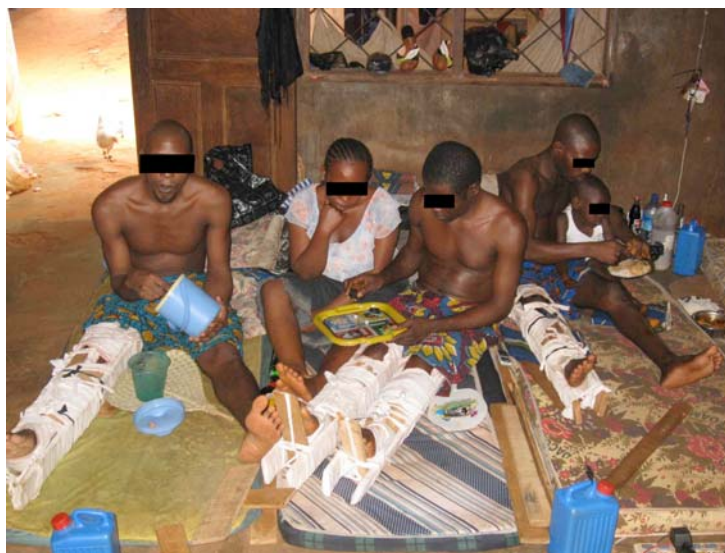
Fig. (1A). (A) Traditional bonesetter patrons waiting for care. (B, C) Traditional bonesetter patrons in their on-site living accommodations.