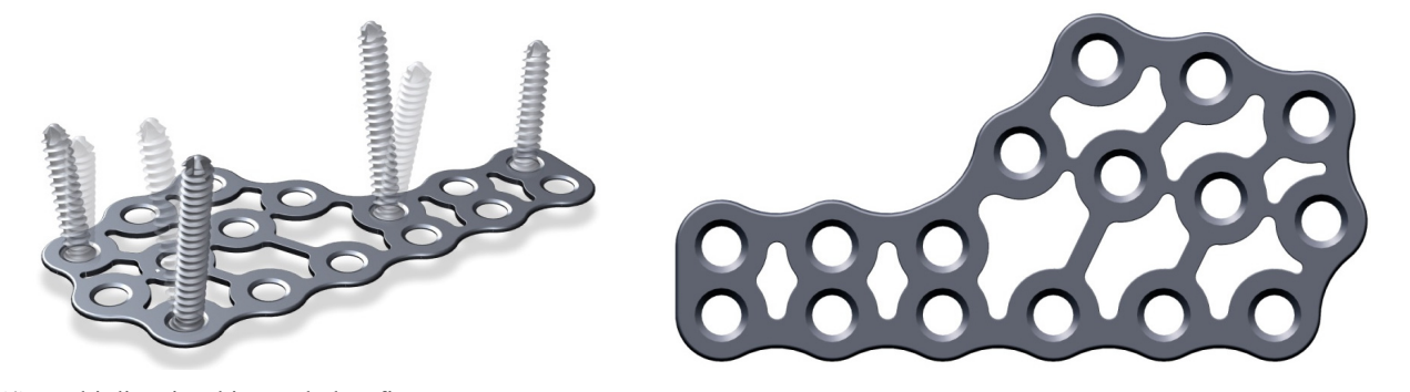
Fig. (4). Multi-directional internal plate fixator.

Until follow-up after an average of 8,6 months, in no case an arthrodesis was required. If the number of patients developing subtalar arthrosis with the need of arthrodesis will increase at long-term follow-up will have to be shown. At the follow up examination all patients had returned to work, or had been judged fit to work by their GP. Seven patients had to change their position within their company, all seven were builders and involved in heavy lifting and climbing ladders as part of their previous position. 66 patients were completely pain free at follow-up. Two