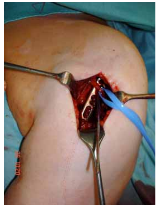
Fig. (4). The plate is positioned distal to the greater tuberosity underneath the axillary nerve.

Operative treatment was performed in beach-chair position. A deltopectoral approach is commonly used [4]. We used a delta-split approach in this study with identification of the axillary nerve (Fig. 4).