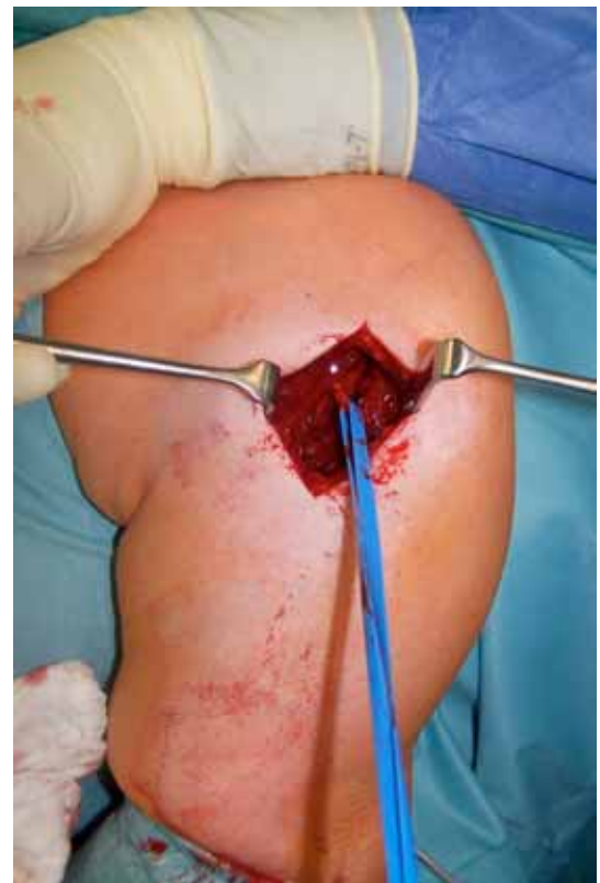
Fig. (3). A delta-split approach was used to identify the axillary nerve.

To simplify soft tissue fixation uniquely designed suture holes accommodate multiple passes e.g. to allow tuberosity repair (Fig. 3).