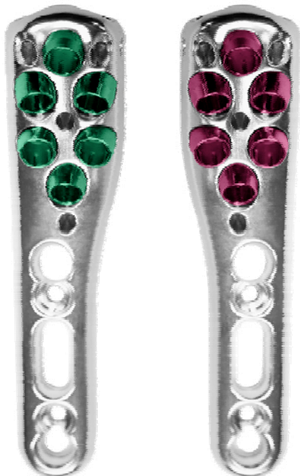
Fig. (2). The S3 Humeral Plate is anatomically contoured to match the complex shape of the proximal humerus. To simplify soft tissue fixation uniquely designed suture holes accommodate multiple passes e.g. to allow tuberosity repair.

To simplify soft tissue fixation uniquely designed suture holes accommodate multiple passes e.g. to allow tuberosity repair (Fig. 3).