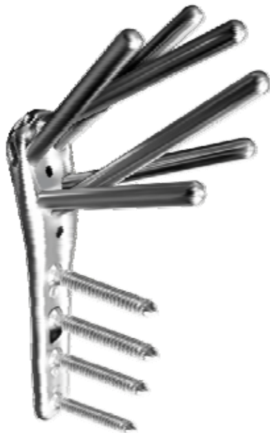
Fig. (1). The S3 Humeral Plate can be used with subchondral support pegs or with screws.

ture reduction (Fig. 1). F.A.S.T (Fixed Angle Screw Targeting) Guide Technology offers preloaded single use disposable drill guides (Fig. 2). Blunt-tipped subchondral support pegs provide improved stability while preventing protrusion through the articular surface.