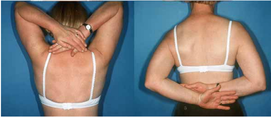
Fig. (7). At follow up at 12 weeks the R.O.M. was unrestricted without sign of impingement.

plate's position distal to the greater tuberosity. At least the theoretical advantage of the positioning of this plate device appears to perform well. A long term follow up with a larger case series is required to judge about this fact.