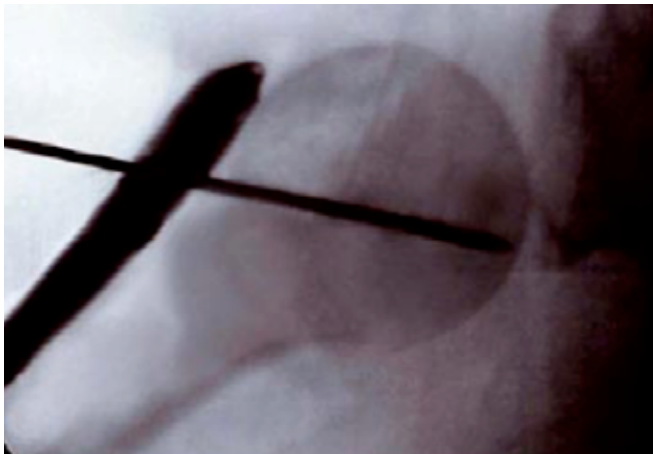
Fig. (5). A guide wire is advanced under fluoroscopic imaging.

After debridement the fracture needs to be reduced through traction and manipulation. The plate is positioned approximately 3.0 cm distal to the greater tuberosity and just lateral to the bicipital groove under protection of the axillary nerve [4]. The plate is secured to the humeral shaft using a 3.8 mm multidirectional cortical screw through the oblong hole of the plate. While maintaining the reduction a 2.0 mm guide wire is placed through the central hole at the head of the plate. The guide wire should be advanced slowly under fluoroscopic imaging until it reaches 2-3 mm below the subchondral bone (Fig. 5). Using the short 4.0mm drill bit, drilling under power through the F.A.S.T Guides across the near cortex until the mechanical safety stop of the drill is performed. The appropriate 4.0 mm long drill bit is advanced manually through the F.A.S.T Guides under fluoroscopic imaging about 2-3 mm below the subchondral bone. Proximal plate pegs should be torque that they are fully seated. The head of a properly seated peg should sit beneath the surface of the plate. By using the end of the drill guide labeled "90°" the remaining shaft screws are drilled. Each 90° locking shaft screw is fixed with a locking set screw. The tuberosities can be fixed using the side loading suture attachments points; we use Orthocord or PDS for this. The humerus is evaluated under fluoroscopy to assess the final reduction and to confirm proper peg positioning.