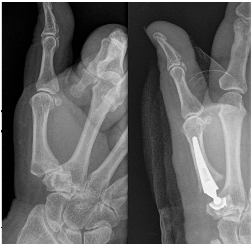
Fig. (2). Pre and post-operative radiographs.