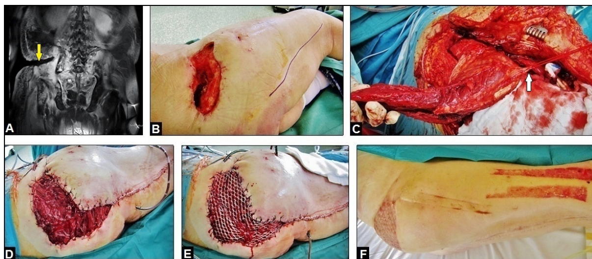
Fig. (2). : (A) Coronal MRI 4 months after first presentation demonstrating right deep soft tissue gluteal cavity (yellow arrow). (B) Clinical photograph 4 months after first presentation showing the right gluteal extended soft tissue defect with its deep cavity which communicates with the sacral/iliac bones and the GRA. The blue line demonstrates planning of surgical incision at the posterior aspect of the right thigh. (C) Intraoperative photograph showing the detached LHBFM at its distal insertion at the right fibular head and before its detachment at its proximal origin at the right ischial tuberosity. Note the carefully dissected and obtained major proximal perforator for the LHBFM (white arrow). (D) Intraoperative photograph showing transposition of the right LHBFM 180° turnover flap into the right deep gluteal cavity after incision of the adjacent skin bridge. (E) Intraoperative photograph showing primary coverage of the right LHBFM 180° turnover flap by split skin grafts from the right thigh. (F) Clinical photograph 4 weeks after coverage showing uneventful wound healing.

Initially, the patient was stabilized in our intensive care unit, intravenous application of vancomycin was started, and surgical abscess revision through a ventral abdominal incision was done by the visceral surgeon (local drains were placed additionally). After 1 week, the septic serum parameters did not decrease, hence, the excision of the right femoral head was performed by us creating a Girdlestone Resection-arthroplasty (GRA) accompanied with a temporary insertion of a palacos cement spacer containing vancomycin through a lateral incision at the thigh (Fig. 1B). Histological examination revealed acute osteomyelitis of the femoral head. After that, the septic serum parameters did not decrease markedly again. Another 1 week later, a massive right gluteal skin necrosis occurred pressure-related by a deep gluteal soft tissue abscess formations with positive microbiology for MRSA again according to the initial positive blood culture, and first now in addition to Multidrug-resistant Pseudomonas aeruginosa (MRPA) (Fig. 1C) that required 15 radical surgical debridements accompanied with negative-pressure vacuum assisted (VAC) therapies combined with further intravenous application of antibiotics.