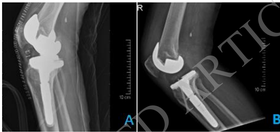
Fig. (1). A comparison of the recovery room radiographs (A) vs. radiology suit radiograph (B) in the same knee demonstrates an inferior quality of the recovery room radiograph (A).

*A p value of 0.01 or less is significant