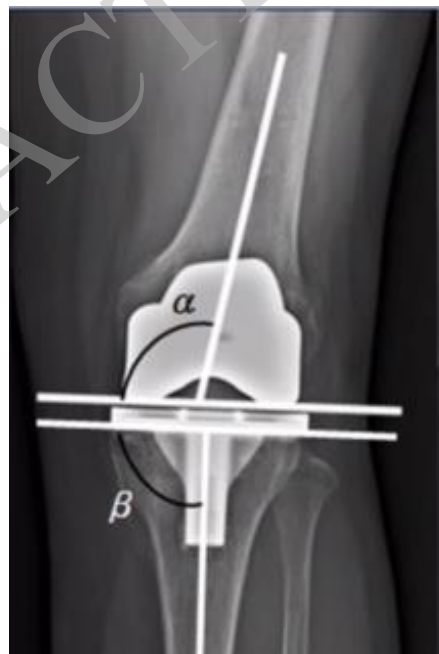
Fig. (2). Methods of coronal angle measurements on AP views.

Femoral component coronal alignment = 90 - alpha