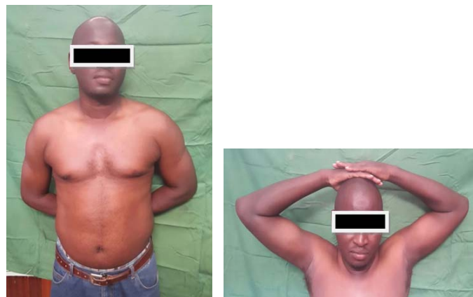
Fig. (6). Satisfactory functional result of the shoulder in the 7th month.

At seven months' follow-up, the shoulder was painless with normal mobility Fig. (6). At the elbow, the patient reported moderate pain during efforts. Prono-supination and flexion were almost normal, but the patient had a 7° elbow extension deficit Figs. (7 and 8).