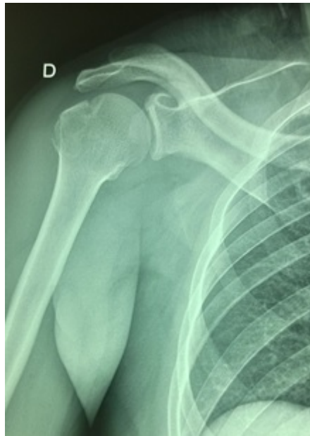
Fig. (4). Post-reductional AP X-ray control of the fracture-dislocation of the shoulder.