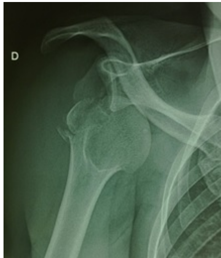
Fig. (1). Anteromedial fracture dislocation of right shoulder