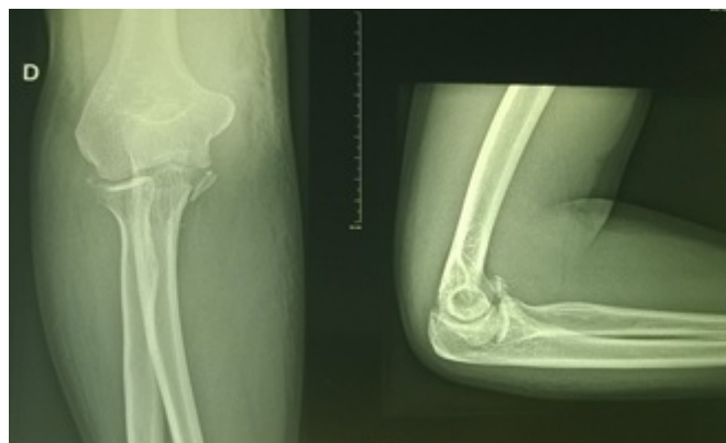
Fig. (5). Post-reductional X-ray of the elbow fracture-luxation.

At seven months' follow-up, the shoulder was painless with normal mobility Fig. (6). At the elbow, the patient reported moderate pain during efforts. Prono-supination and flexion were almost normal, but the patient had a 7° elbow extension deficit Figs. (7 and 8).