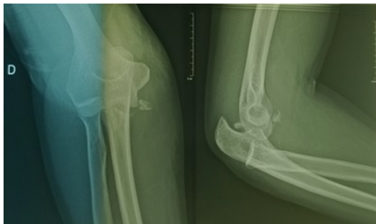
Fig. (2). Posterolateral fracture dislocation of the right elbow.