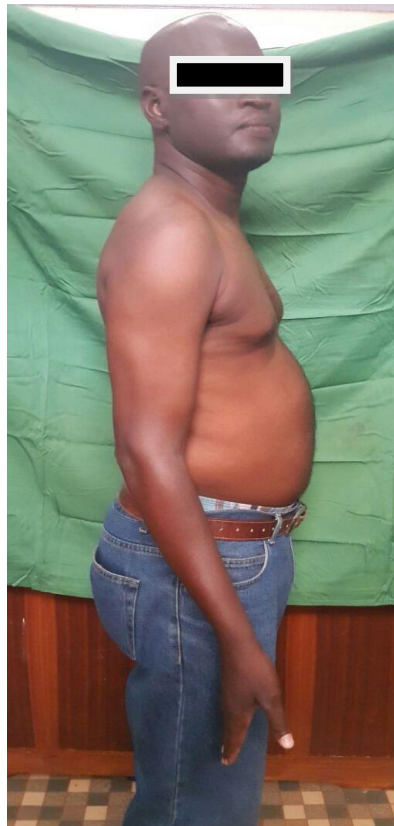
Fig. (8). Slight deficit in elbow extension at seven months' follow-up.