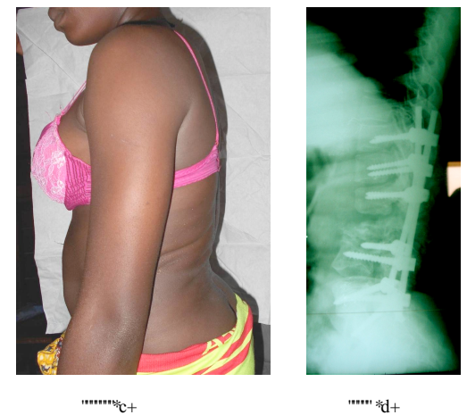
Fig. (1). (a-b). Severe angular lumbar kyphosis involving destruction of L1, L2 and L3. Preoperative x-ray showing a 75° kyphosis. (c-d). Postoperative clinical and radiographic aspect after correction by pedicle substraction osteotomy and instrumentation from T11 to S1.