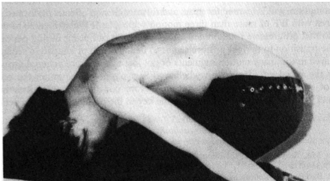
Fig. (1). Impaired Forward Flexion (adapted from [52]).

year-olds (7.9%) than in 4 and 5-year-olds (78.9% and 70.8%, respectively) and hypothesize that the reason for this is the transition from crawling to upright posture.