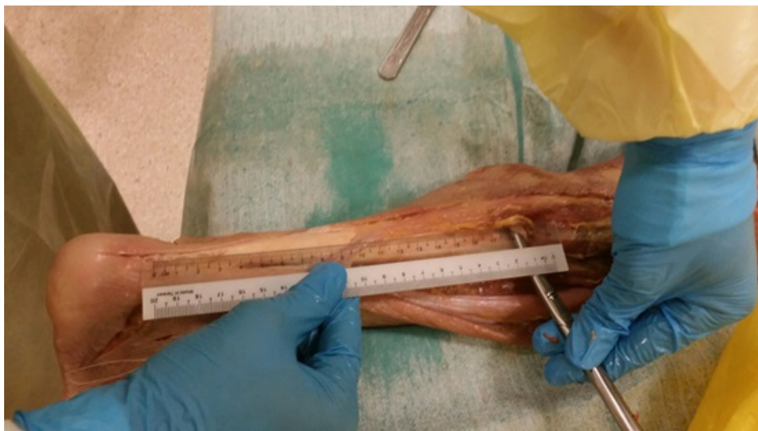
Fig. (2). Measurement from the calcaneal tuberosity to point of insertion of the gastrocnemius tendon into the Achilles tendon.