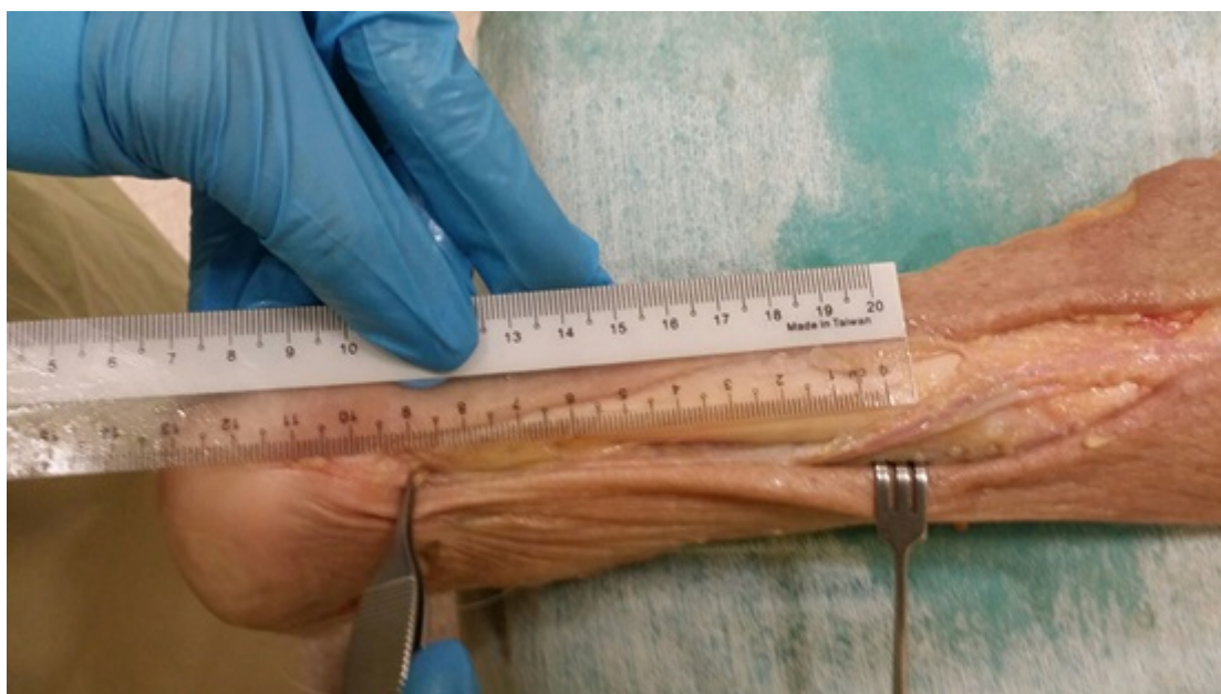
Fig. (1). Measurement from the calcaneal tuberosity to where the sural nerve crosses the lateral border of the Achilles tendon.

Dissection and measurement of the cadaveric limbs were carried out by a single, fellowship trained Orthopaedic Surgeon. The limbs were placed in a prone position. A generous midline longitudinal incision was made from the middle of the popliteal fossa to the calcaneal tuberosity for each limb. The gastrocnemius muscles, gastrocnemius tendons and the insertion of the Achilles tendons into the calcaneal tuberosity were visualized. The sural nerve was also identified, explored and its course visualized for all 12 legs. The distances from the calcaneal tuberosity to where the sural nerve crosses the lateral border of the Achilles tendon (Fig. 1) as well as the distances from the calcaneal tuberosity to where the gastrocnemius tendon inserts into the Achilles tendon (Fig. 2) were recorded.