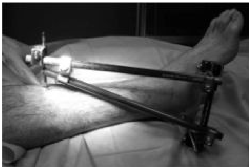
Fig. (1). Temporary external fixation, called "tripolar".