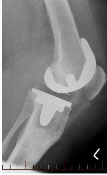
Fig. (3). Anteroposterior and lateral radiographs taken one year following conversion to total knee replacement. The visible Triosite graft did not compromise the surgical procedure and rehabilitation programme.