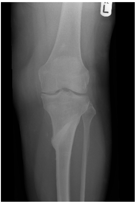
Fig. (2). Appearances of the tibia 4 years following HTO and subsequent plate removal. The Triosite wedge was still visible radiologically.

Femorotibial alignment, measured on AP weight-bearing long leg radiographs averaged 182° pre-operatively and 173° post-operatively for an average correction of 9° (range 5-14°). Following union the femorotibial alignment averaged 174°. The Trisoite (Zimmer) wedges remained radiologically visible in all cases even those out to 9 years post implantation (Fig. 2).