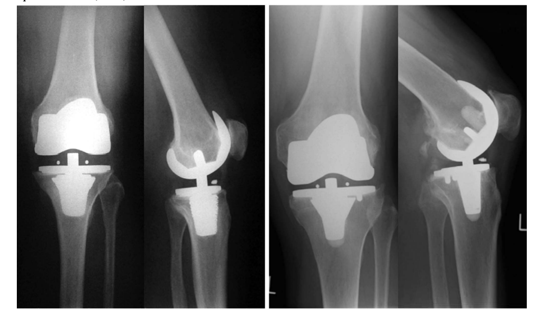
Fig. (2). X-rays (anterior-posterior and lateral) of the knee joint of a 73-year-old female patient 25 months after implantation of a cement-free Genia<sup>®</sup> total knee replacement (left) with an anti-allergic (Ti(Nb)N) coating, as well as X-rays of a 55-year-old male patient 24 months after implantation of a cemented Genia<sup>®</sup> total knee replacement made of a cobalt-chromium alloy (right). No radiolucent lines were detected around the components in either of these cases. In the lateral view of the total knee replacement with the anti-allergic coating, a gap is visible in femoral zone 1, which is caused by discrete over-dimensioning with flexed positioning of the component.

total knee endoprosthesis Genia<sup>®</sup> in comparison to a matched control group with the use of uncoated implants of an identical geometry. In an independent prospective study with an uncoated implant type of the same design, 75.6 points (HSS scores) were achieved six months after surgery [1]. Other studies using different TKR systems identified HSS score values between 85.0 and 93.0 points one year postoperatively, with a similar average preoperative score of 55.9 to 62.0 points [22, 23]. The control group achieved similar high scoring values during the follow-up examinations.