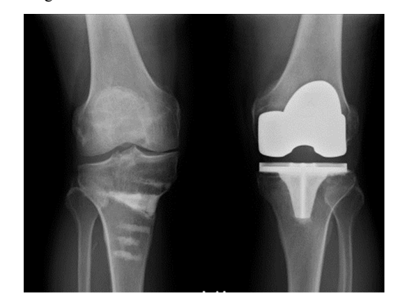
Fig. (1). Preoperative X-ray image.

The weight-bearing radiogram showed a Kellgren-Lawrence OA grade of 3. The anatomical lateral distal femorotibial angle was 166°.