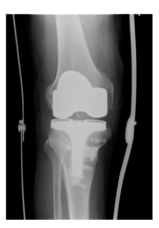
Fig. (3). Postoperative radiography at 3 months with a knee brace. A-P view.