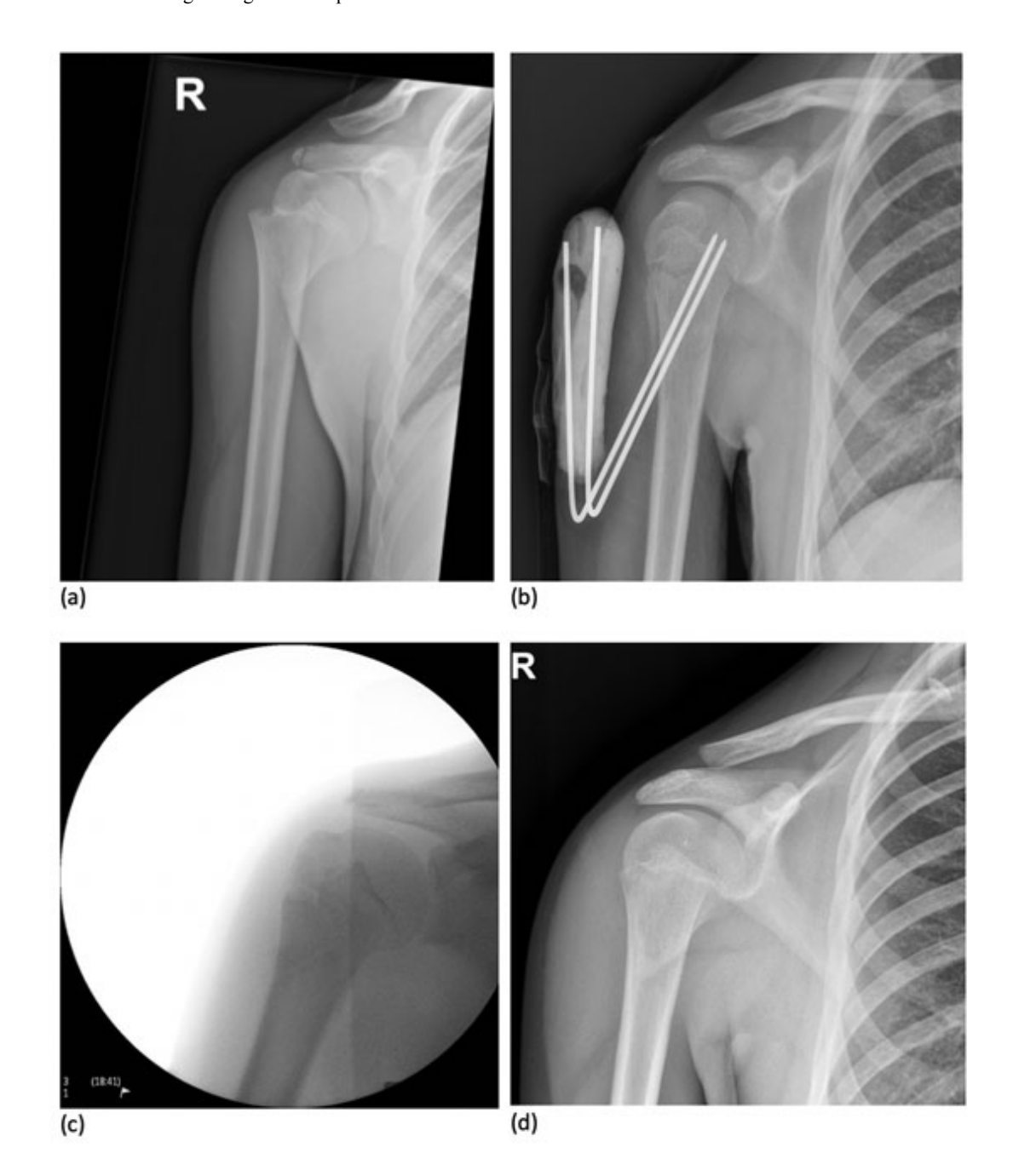
Fig. (2). X-Ray images showing the progressive treatment using K-wires of a skeletally immature patient. Injury (a), K-wire insertion (b), outcome after removal (c), Radiograph at final follow-up (d).

Non-operative treatment was favoured in this case series, in agreement with current literature. The remodelling potential of children is extraordinary, providing a basis for excellent outcomes without surgical intervention. However, as previously discussed, the decision to operate should include a consideration of age, fracture angulation and skeletal maturity.