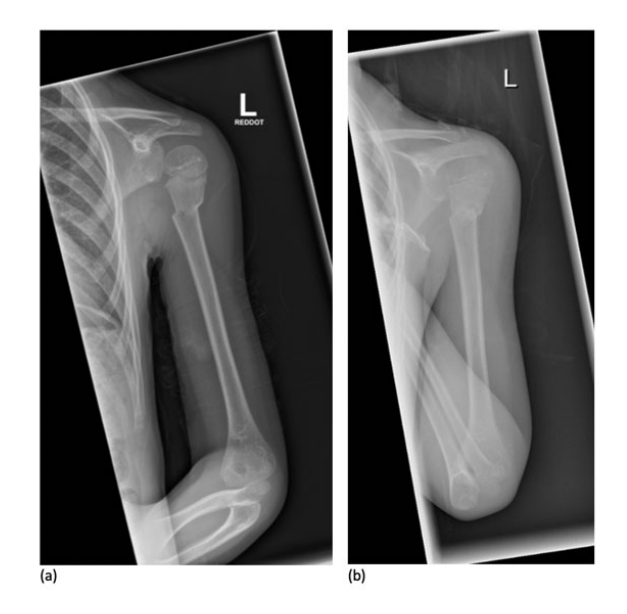
Fig. (1). X-Ray images showing the progression from injury (a) to 7 days after (b) a non-operative approach.

In the first group (under 10 years of age), a non-operative approach is preferable (see Fig. 1 for non-operative approach X-Rays). As seen in our case series, even a severely displaced fracture of 21mm of translation and 49 degrees of AP angulation was deemed acceptable and treated with a collar and cuff. The outcome was successful with the restoration of full limb function. Although satisfactory clinical progress took longer than the average in our cohort, the risk of undergoing unnecessary surgery was avoided.