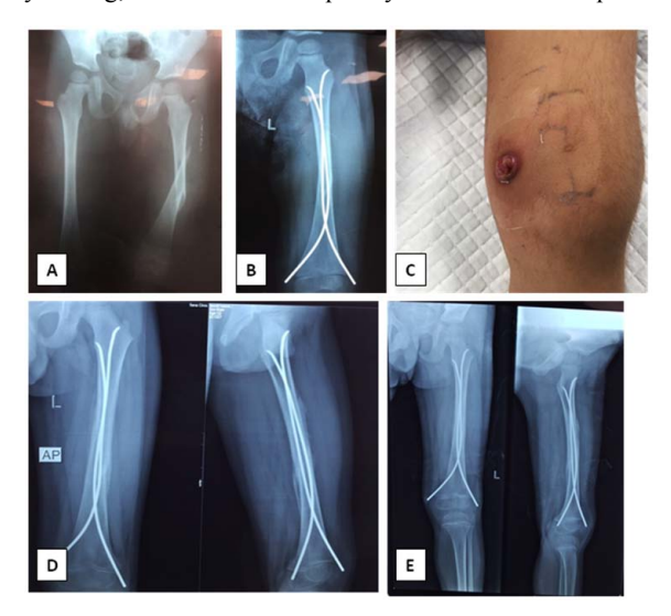
Fig. (3). A 4.5-year-old boy who sustained a closed spiral fracture of the left femoral shaft due to a fall (low-energy trauma) and was treated with closed reduction internal fixation using flexible intramedullary nailing. (A) Preoperative radiograph. (B) Initial postoperative radiograph showing <50^{\circ} varus. (C) Ulcer at the medial nail insertion site with superficial infection overlying the prominent nail. (D) Four-week follow-up showing a bridging callus at all cortices in both views. (E) Six-week follow-up showing that the fracture almost united; nails were removed 8 weeks after the first surgery, and the superficial infection healed.