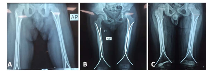
Fig. (4). A 6-year-old boy who sustained a bilateral oblique femoral fracture due to a motor vehicle accident (high-energy trauma) who was treated with ESIN. (A) Bilateral fracture treated with ESIN. (B) Partial union of the femurs. (C) Complete union of the femurs was achieved within 9 weeks without any complication.