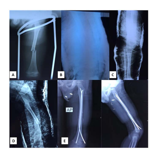
Fig. (2). A 5.5-year-old boy who presented with a left closed transverse fracture of the femoral shaft due to a motor vehicle accident (high-energy trauma) and was initially treated with noninvasive traction for 9 days, followed by spica casting. (A) Preoperative radiograph. (B & C) Initial postoperative anteroposterior and lateral radiographs showing acceptable alignment. (D) Anteroposterior radiograph taken 15 days after spica casting showing loss of reduction ( 30^\circ varus and >2-cm shortening). (E) Conversion to surgical fixation with flexible intramedullary nailing; the fracture subsequently healed without sequelae.