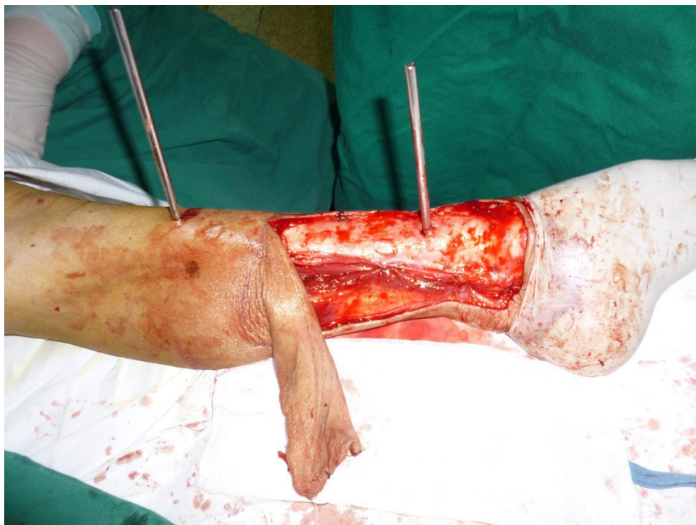
Fig. (5b). The procedure of cross-leg flap transplantation (a: the design of cross-leg flap, b: the harvest of cross-leg flap, c: the cross-leg external fixation and the anastomosis between cross-bridge flap and combined flap).