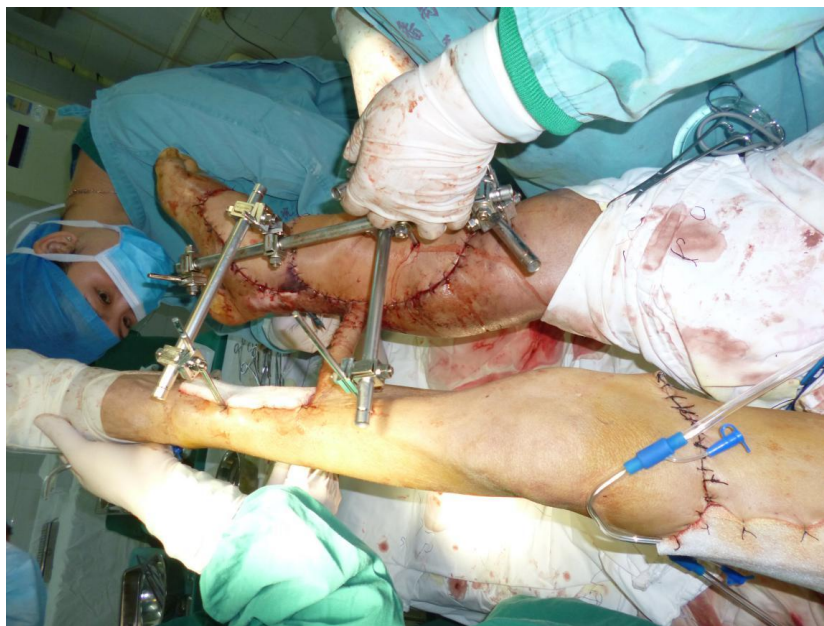
Fig. (5c). The procedure of cross-leg flap transplantation ( a: the design of cross-leg flap, b: the harvest of cross-leg flap, c: the cross-leg external fixation and the anastomosis between cross-bridge flap and combined flap).