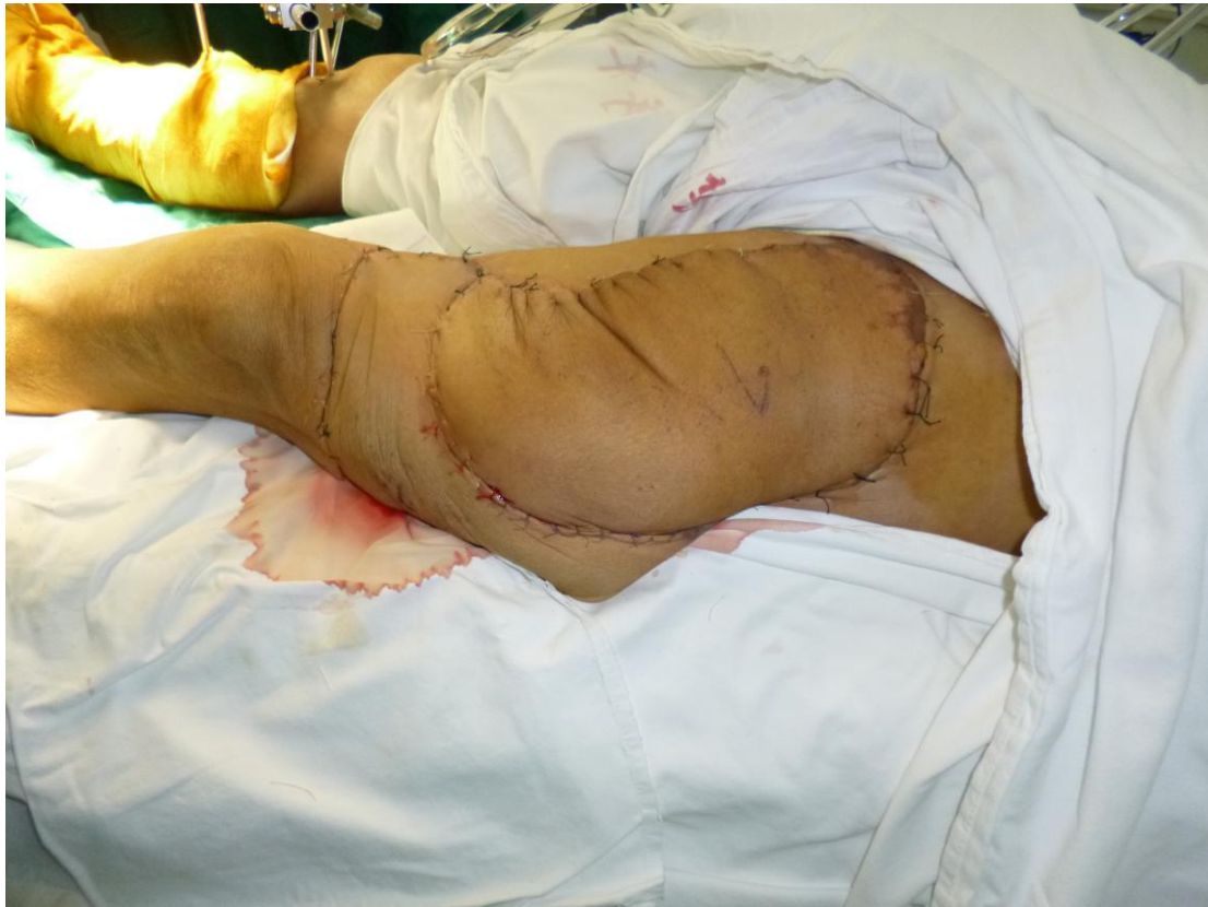
Fig. (4d). The design and harvest of combined flap consisted of anterolateral thigh perforator flap and thoracic umbilical flap (a: the design of the combined flap, b:the harvest of thoracic umbilical flap, c: the harvested combined flap, d:the combined flap was temporarily sutured to the donated area of anterolateral thigh perforator flap).