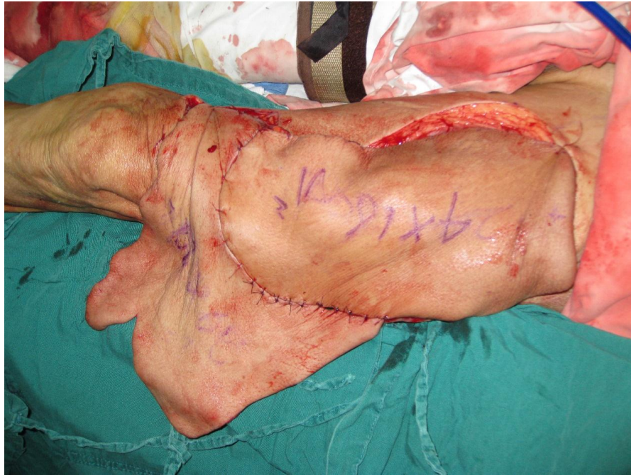
Fig. (4c). The design and harvest of combined flap consisted of anterolateral thigh perforator flap and thoracic umbilical flap (a: the design of the combined flap, b:the harvest of thoracic umbilical flap, c: the harvested combined flap, d:the combined flap was temporarily sutured to the donated area of anterolateral thigh perforator flap).