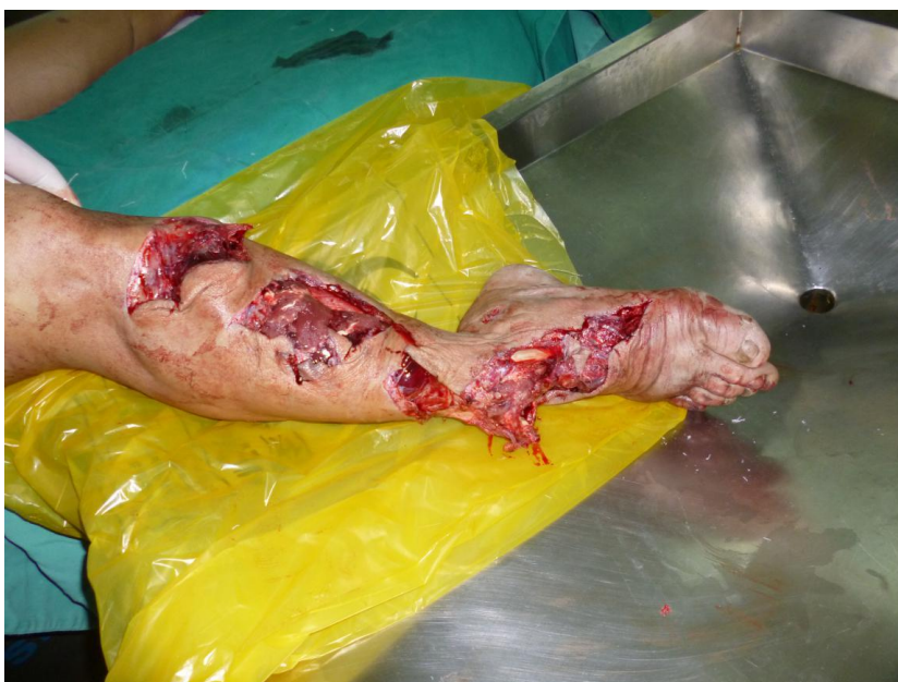
Fig. (1a). Extensive soft-tissue defects of the right lower leg and foot before debridement, accompanied by comminuted fracture of the proximal tibia, spiral fracture of the proximal fibula, fracture of the talus, and dislocation of the ankle joint. (a: clinical photo, b: x-ray of the leg, c: x-ray of the ankle).

A 54-year-old male had his right lower leg injured by a motorcycle wheel in a traffic accident, which led to the disfunction of the wounded leg with continuously intense pain. Bone, tendon, vessels and nerves were exposed with extensive soft-tissue defects of the wounded leg (Fig. 1a). Radiographs showed tibial comminuted fracture, talar open fracture and subluxation of right ankle (Figs. 1b-c).