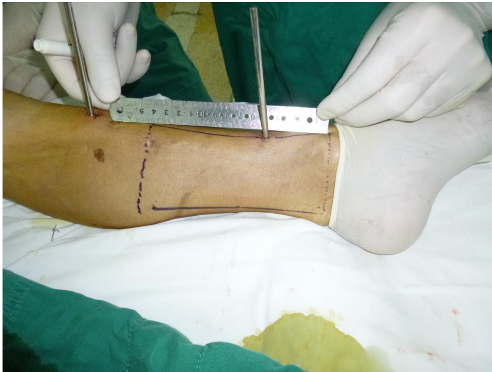
Fig. (5a). The procedure of cross-leg flap transplantation (a: the design of cross-leg flap, b: the harvest of cross-leg flap, c: the cross-leg external fixation and the anastomosis between cross-bridge flap and combined flap).