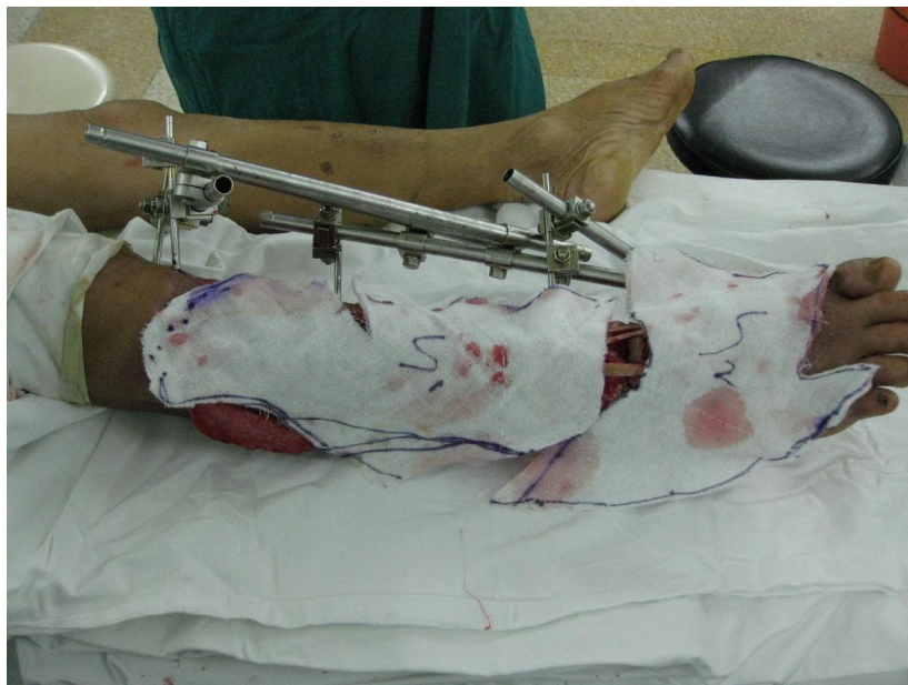
Fig. (4a). The design and harvest of combined flap consisted of anterolateral thigh perforator flap and thoracic umbilical flap (a: the design of the combined flap, b:the harvest of thoracic umbilical flap, c: the harvested combined flap, d:the combined flap was temporarily sutured to the donated area of anterolateral thigh perforator flap).