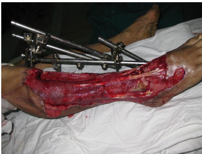
Fig. (3). Healthy granulation tissue surrounding the soft-tissue defects after repeated debridement and VSD.