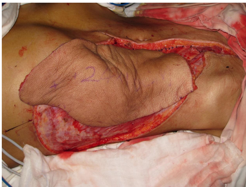
Fig. (4b). The design and harvest of combined flap consisted of anterolateral thigh perforator flap and thoracic umbilical flap (a: the design of the combined flap, b:the harvest of thoracic umbilical flap, c: the harvested combined flap, d:the combined flap was temporarily sutured to the donated area of anterolateral thigh perforator flap).