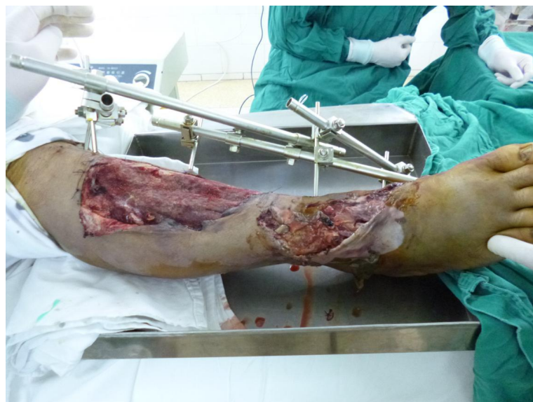
Fig. (2). An external fixator was applied to stabilize the fractures. There was an extensive soft tissue defect with sluggish circulation.

One hour after admission, emergency operation was performed in the condition of general anesthesia. The necrotic tissue was completely debrided in the first place. After primary debridement, the talar fracture was fixed with two 5mm screws. The dislocation of ankle joint was properly corrected. The comminuted proximal tibial fracture was immobilized by an external fixator and there was a dull-red coloured wound of 40cm × 10cm, with deep tissue exposed, necrotic tissue and faint yellow purulent secretions (Fig. 2). Direct anastomosis of anterior tibial artery, its accompanying vein and perforating branch of the peroneal artery were performed separately. The wounds were covered with two VSD sponges, sealed by two semipermeable membranes of 20cm × 10cm in size. The negative pressure was provided by negative drainage bag. About 2000 ml of blood was lost pre-operatively and intra-operatively. Moreover, the VSD led to the further decrease in the level of hemochrome in the blood of patient. Supportive and symptomatic treatment was performed after emergency operation. After three days of operation, second-time debridement and VSD were performed. Another three debridement operations and VSD were performed at the seventh, fourteenth, and thirtieth day separately. At this moment, fresh granulation tissue surrounded the soft-tissue defects (Fig. 3).