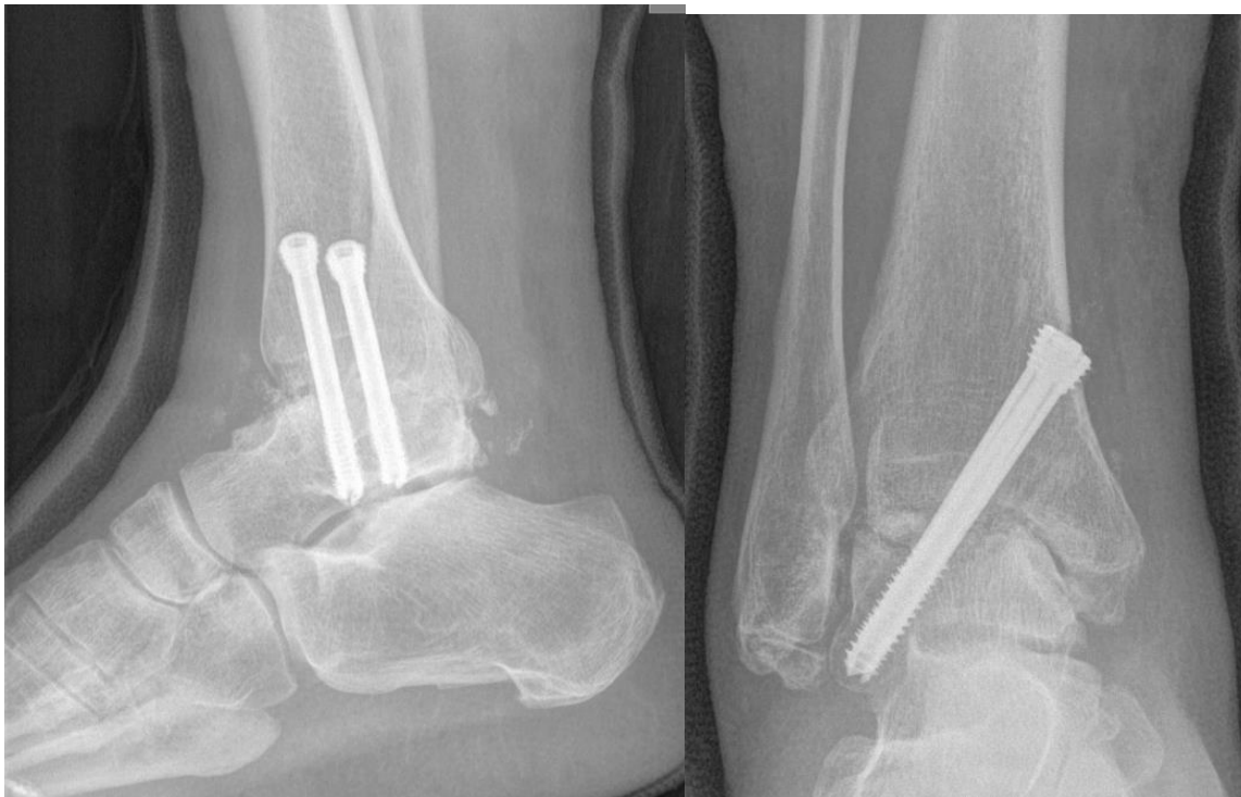
Fig. (5). Non-weight bearing AP and lateral radiographs two weeks after AAA with two parallel HCS compression. Note distal HCS threads are within lateral talar process and proximal covered in thinner medial tibial cortex causing any impingement on soft tissues.