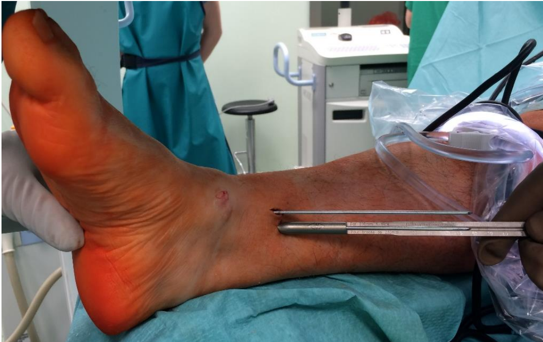
Fig. (2). Precise measurement of the screw length. The K-wires were withdrawn on the medial tibia until they were completely flush with the lateral talar process, which can be checked by finger palpation and/or C-arm control. This step allows for very precise measurement of the screw length over the K -wire.