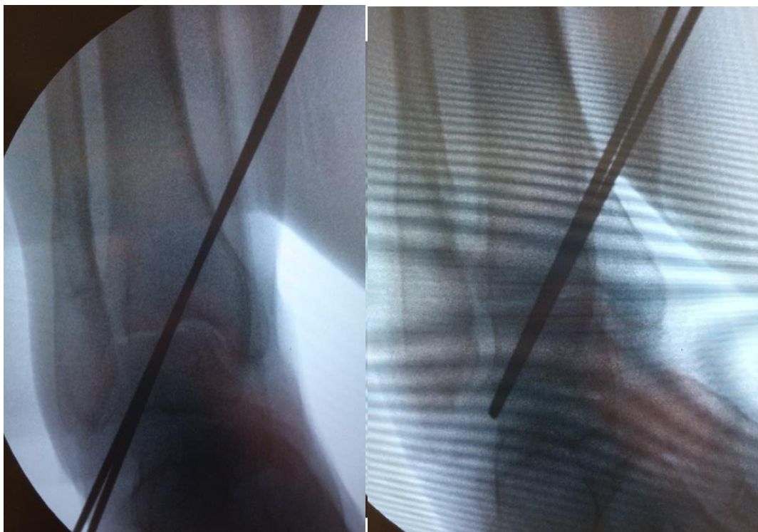
Fig. (1). C-arm view of the right ankle with two parallel K-wires introduced from lateral talar process across debrided ankle joint in Step 1 of the procedure (left). K-wires are then withdrawn with the power drill on the medial side, until they are completely flush with the lateral talar process, what can be checked by a finger palpation and/or C-arm control in Step 2 (right).

The K-wires were withdrawn with the power drill on the opposite side of the medial tibia until they were completely flush with the lateral talar process, which can be checked by finger palpation and/or C-arm control (Fig. 1). This step allows for very precise measurement of the screw length over the K-wire. After measuring the screw length over the K-wire (Fig. 2), the K-wires were pushed back with the power drill again to stick out from the talus entry points. This maneuver serves as a backup and helps remove K-wires in case they break or bend while drilling with a cannulated drill or during final screw insertion.