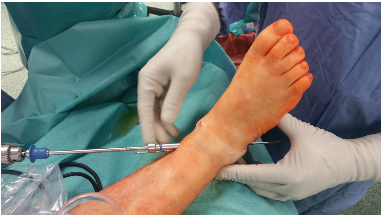
Fig. (3). Antegrade drilling with soft tissue protector inserted. Note the K-wires are pushed back down again and extend from wound on the lateral side. That manoeuvre serves as a backup and helps to remove K-wires in case they brake or bent while using cannulated drill.

A stab incision was performed around the K-wires to the medial tibia, a soft tissue protector inserted, and cannulated drill introduced from the tibial medial cortex into the talus. A 7.3-mm cannulated HCS was introduced to the point that the entire head was inside the cortex (Fig. 3). Two HCSs were used in every patient (Figs. 4-6).