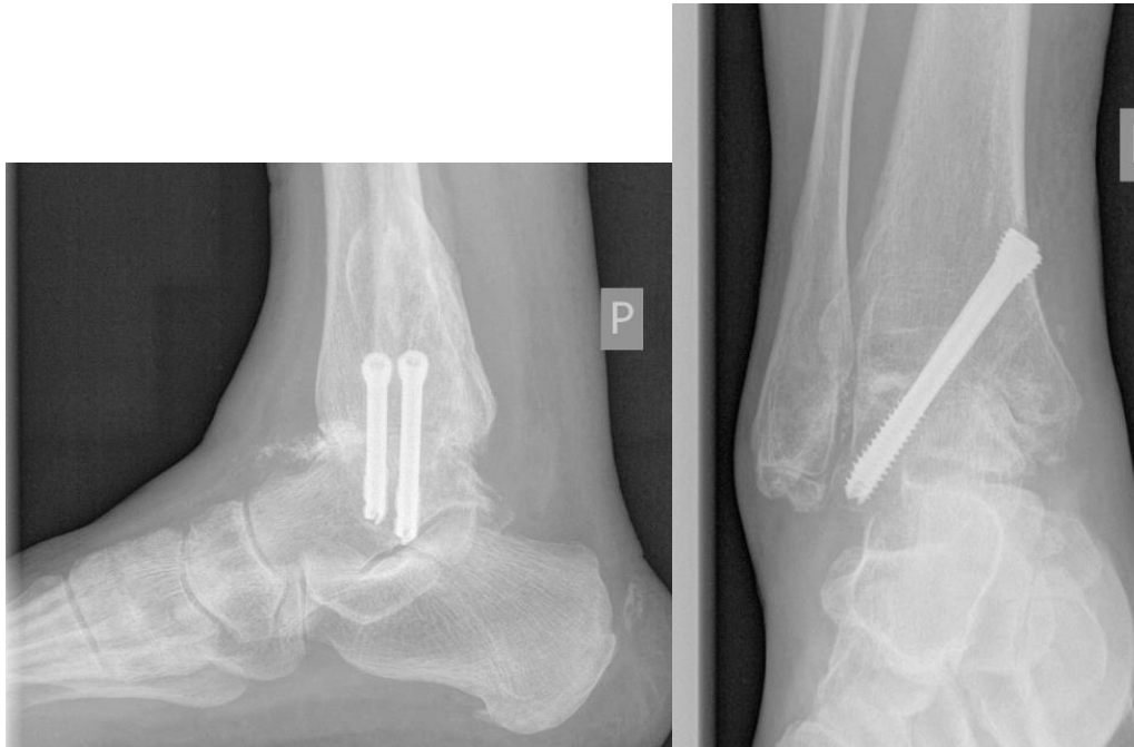
Fig. (6). Weight bearing AP and lateral radiographs six weeks after AAA with two parallel HCS compression. Note radiographic bone union at the arthrodesis site.