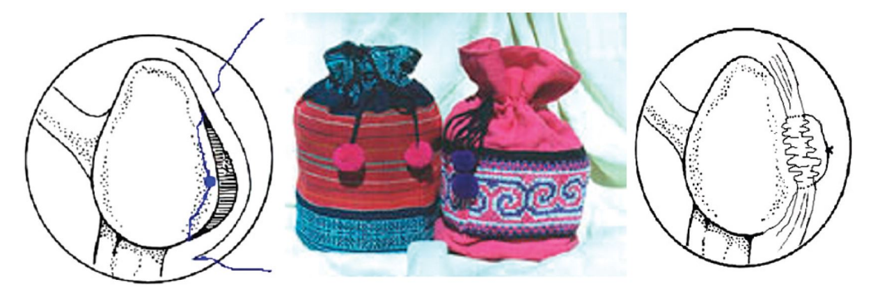
Fig. (1). The suture through the capsulolabral complex tightens the tissue in the same manner as the drawstring of a purse [8].

neck is created (and not only 'spot welding'), as well as an anterior bumper with the mass of gathered tissue within the 'purse-string' suture Fig. (2). Once the purse-string suture has been tied, the resultant "bumper\" of capsulolabral tissue is probed to ensure it is firmly fixed to the glenoid. A rotator interval closure may be performed at this stage if necessary. If necessary, an additional anchor may be placed further superior on the glenoid to supplement the repair.