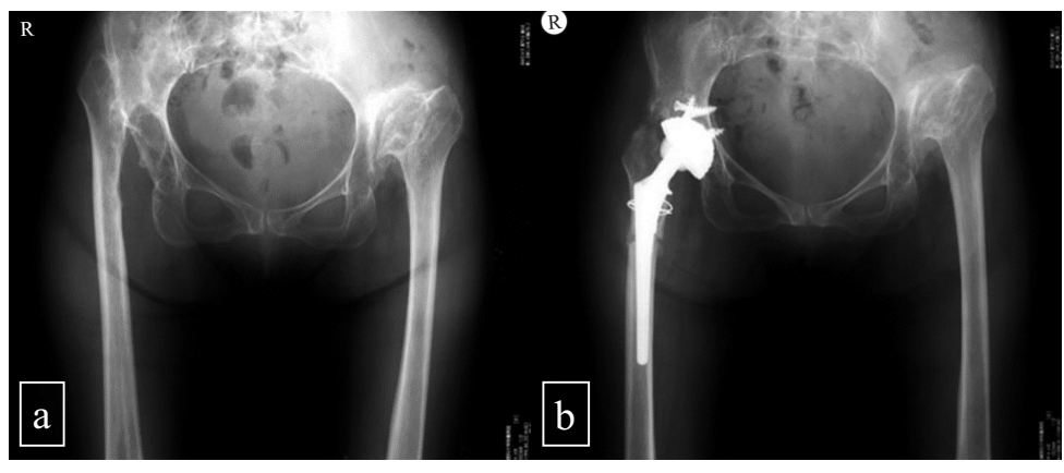
Fig. (2). Total hip arthroplasty with femoral shortening osteotomy in patients with a completely dislocated hip. a, before the operation. b, after the operation.