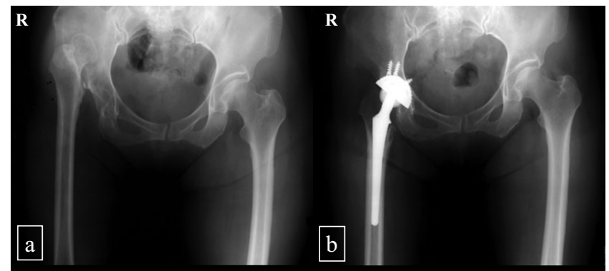
Fig. (1). Total hip arthroplasty without femoral shortening osteotomy in patients with a completely dislocated hip. a, before the operation. b, after the operation.

We performed a retrospective study of all of the patients with a completely dislocated hip joint without pseudoarticulation between the femoral head and iliac bone who underwent THA between October 1999 and September 2001. In total, we performed THA operations on six hips in six patients without subtrochanteric femoral shortening osteotomy (Fig. 1). In same the period, three hips in three patients received THA combined with subtrochanteric femoral shortening osteotomy according in accordance with the procedure described by Sonohata [12] (Fig. 2). These three hips were used as controls.