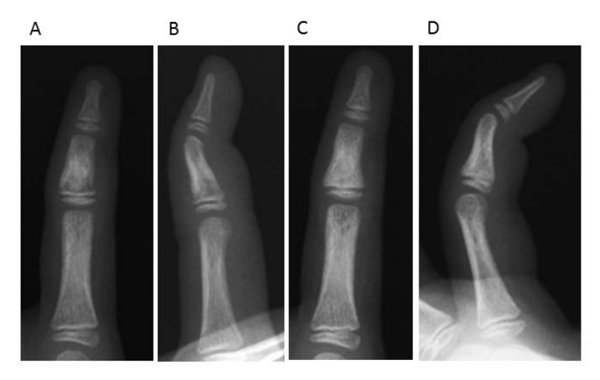
Fig. (4). Three months after symptom onset, less cortical irregularity is evident in the middle phalanx of the left index finger ( A , B ). Four months after symptom onset, no irregular shadows are apparent in the middle phalanx of the left index finger ( C , D ).