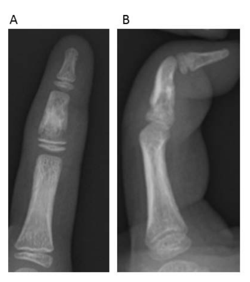
Fig. (3). Two months after symptom onset, an irregular shadow is seen on the middle phalanx of the left index finger, indicating pathological fracture (A, B).