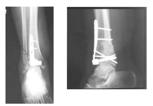
Fig. (4-e). 4-e, 4-f-roentgenograms of the patient's right leg in 2 month after trauma. Osteosynthesis of the right tibia with a plate.

Fig. (4). Patient D 34 years old. Diagnosis: an open tibia and fibular fracture in the lower third of a leg IIIB type by Gustillo-Andersen.