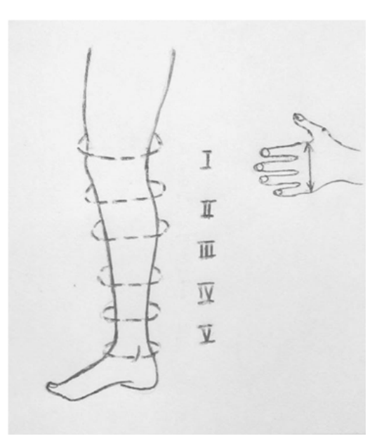
Fig. (2). Division of a leg in levels.