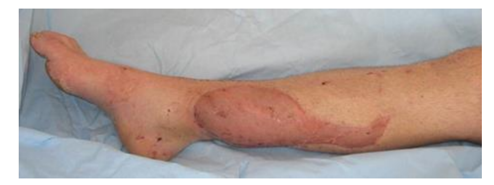
Fig. (4-d). 4-d the patient's right leg in 2 month after trauma.

Fig. (4c). 4-c photo of the patient's right leg in 2 days after trauma. A fixation with an external fixator and closing the soft tissue defect with an anterolateral free muscular flap were performed.