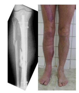
Fig. (3-d, 3-e). 3-d, 3-e roentgenograms of the patient's right leg in 25 days after trauma. Osteosynthesis was performed by an intramedullary locked nail.

Fig. (3). Patient G, 47 years old. Diagnose: Polytrauma ISS 18 points. Open craniofacial trauma. Brain contusion with a middle degree of severity. Extensive lacerated wound of head. Open tibia and fibula fracture in the middle third of the right leg IIIb type by Gustillo-Andersen classification.